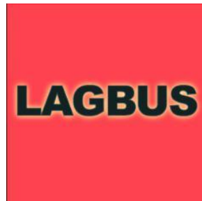
LAGBUS Asset Management Limited