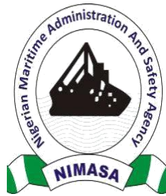
Nigerian Maritime Administration and Safety Agency (NIMASA)