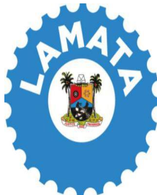
Lagos Metropolitan Area Transport Authority (LAMATA)