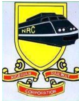
Nigerian Railway Corporation