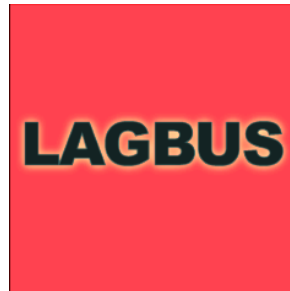
LAGBUS Asset Management Limited